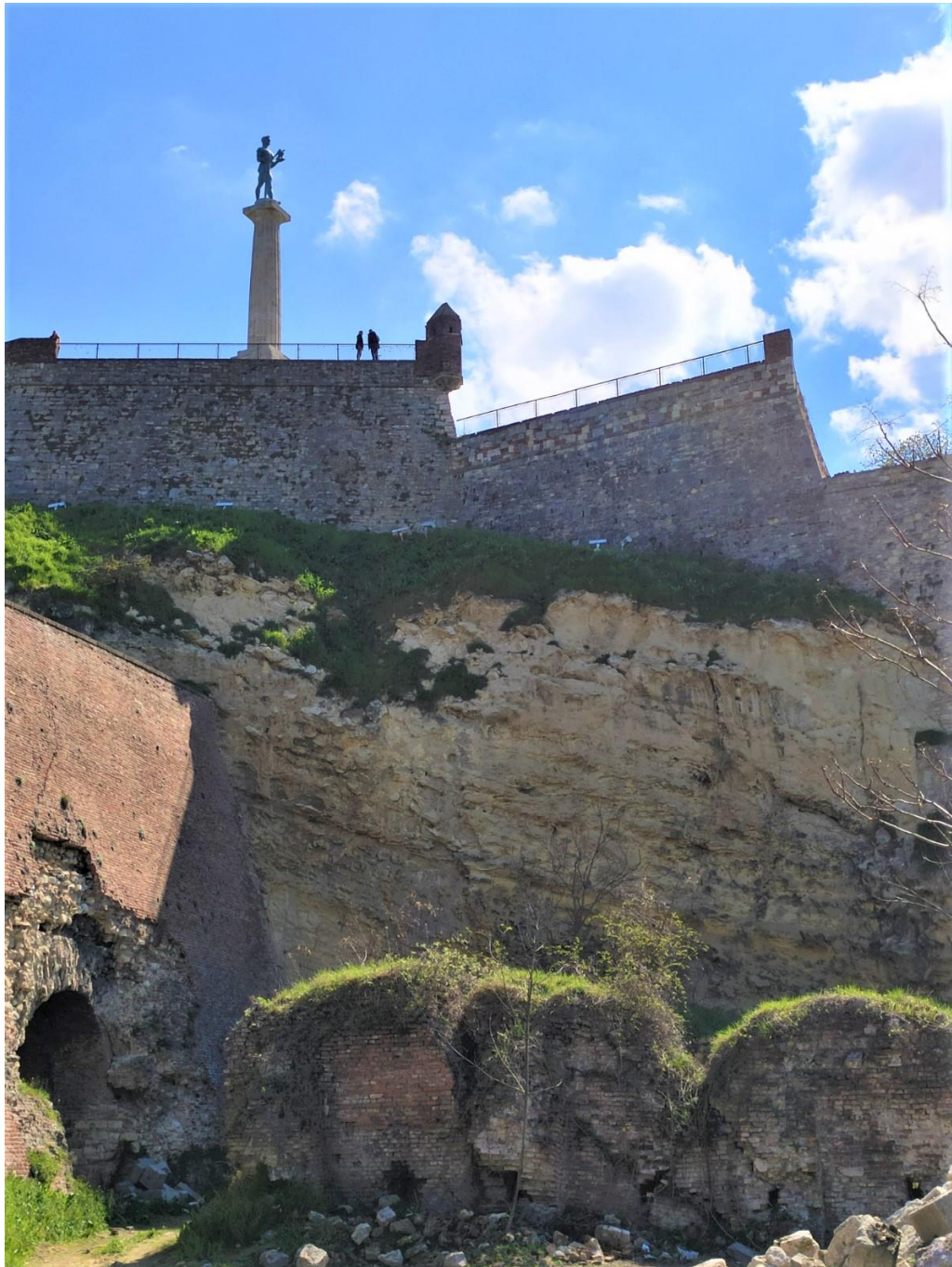
Pobednik (The Victor) is a monument in the Upper Town of the Belgrade Fortress, on top of the Miocene limestones