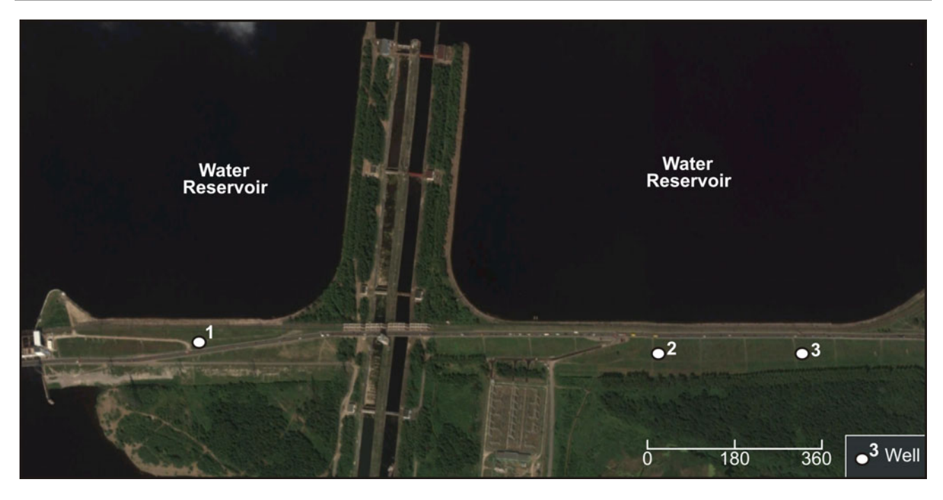
Fig. 2 Location of wells in the dam

microorganisms; therefore experiments were conducted for improvement of sandy soils by way of calcite sedimentation due to the effect of native microbial flora, i.e. without introduction of additional biomass. Experimental soil samples were exposed to the solution in concentration of 60 ml per 1 kg of soil. The solution was prepared from distilled and river water and enriched with various concentrations of glucose, urea, calcium chloride (CaCl<sub>2</sub>), and solid beef-peptone extract as organic nutrient. In the first experimental set, additional biomass of urobacteria was also introduced. After 21 days of curing, soil deformation properties were determined by compression tests. In the course of the experiment, gas content was controlled in the artificial environment to determine intensity of microbiological processes. Upon completion of soils exposure, carbonate cementation and strength links formation was captured via microscopy.